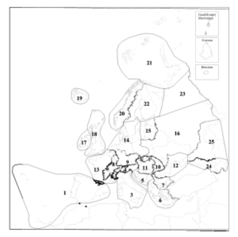
System A: Ecoregions for rivers and lakes